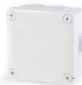
Glow wire 650°C - Version with cable sleeves (1/4 turn screw cover)