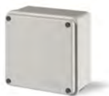
IP56 - Higher box - Blank cover