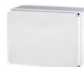
IP56 - Higher box - Clear cover